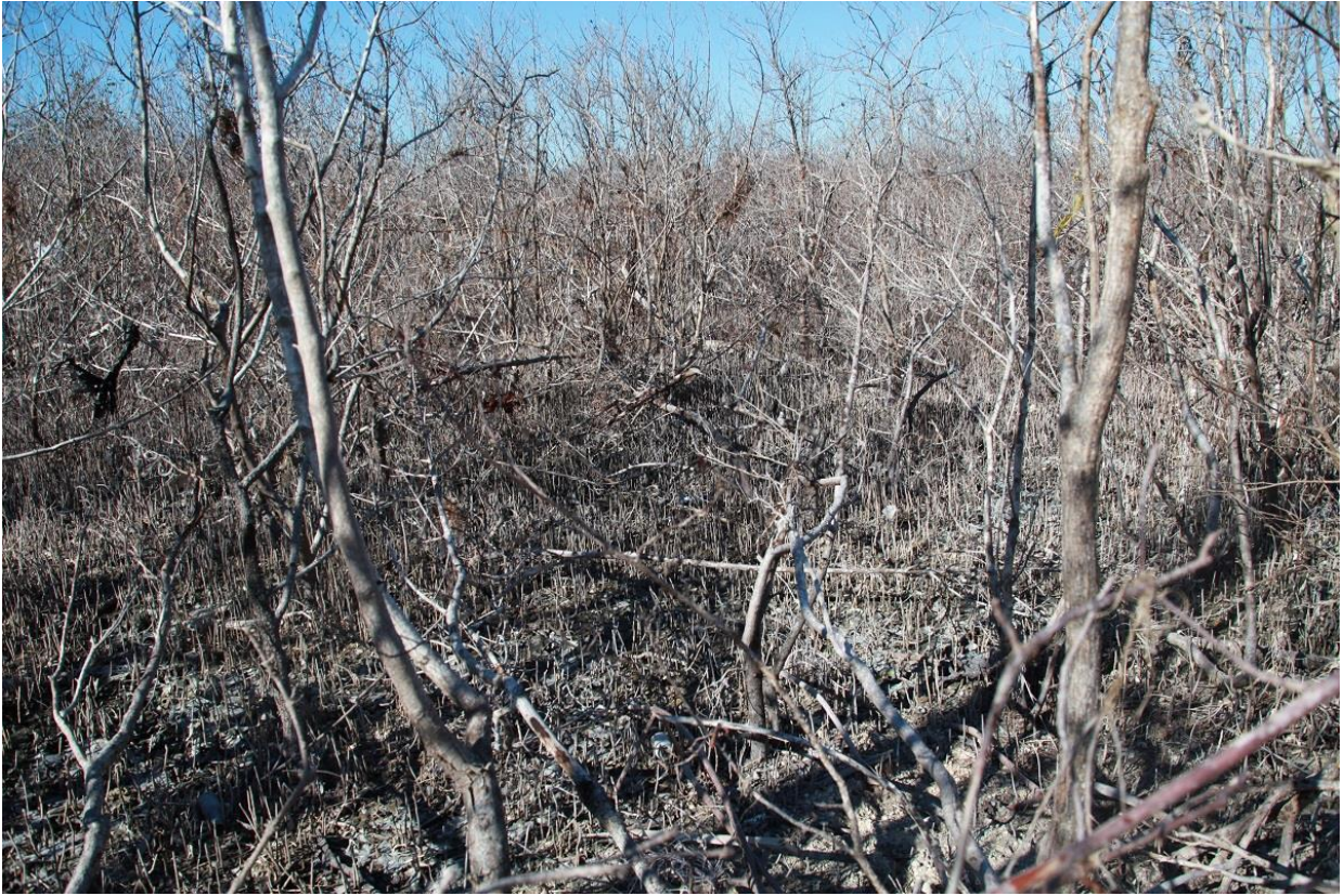
Black mangrove forest with total die-off post-Irma.